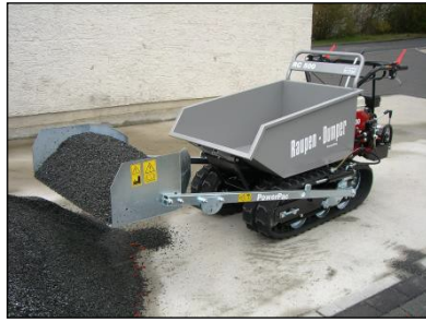
hydr. front loader