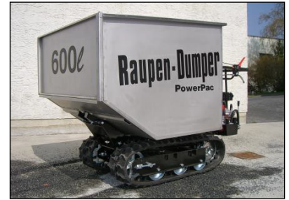
light cargo tray